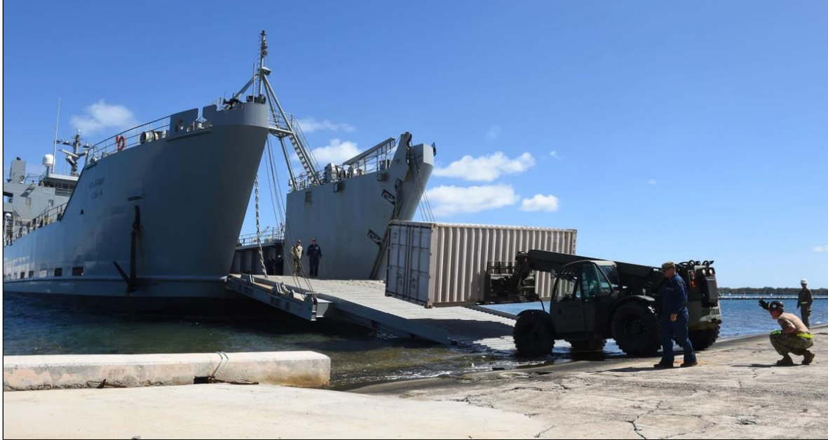
Figure 3. Besson-Class Logistics Support Vessel (LSV)

Source: Cropped version of photograph accompanying Walker D. Mills and Joseph Hanacek, “The US Navy and Marine Corps Should Acquire Army Watercraft,” Defense News , June 22, 2020. The caption to the photograph credits the photograph to the U.S. Navy and states, “U.S. Navy sailors conduct a simulated disaster relief supply offload from a General Frank S. Besson-class logistics support vessel at Joint Base Pearl Harbor-Hickam on July 10, 2016.”