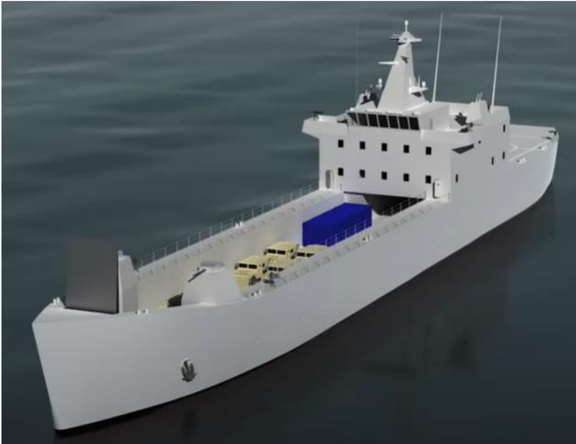
Figure I. Navy Notional LSM Design Concept Computer rendering